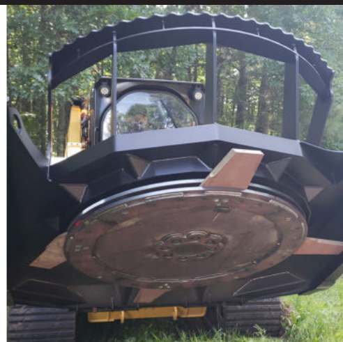
Flat Blade - Optional Carrier