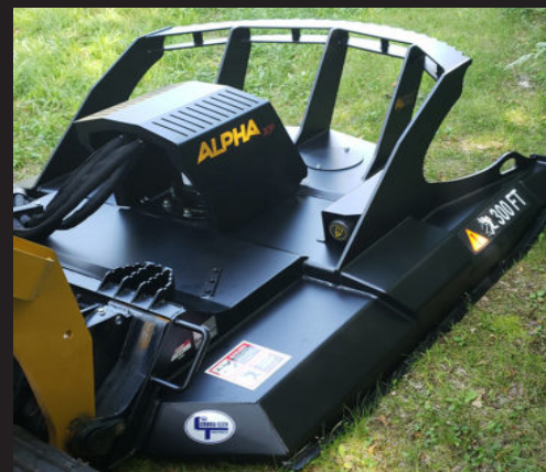
Improved Blade Access