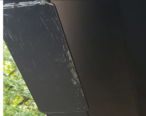
Replaceable Skid Pads AR400