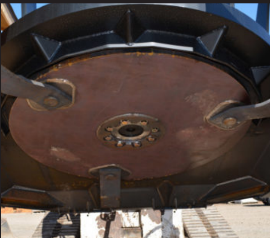
Drop Blades - Standard Carrier