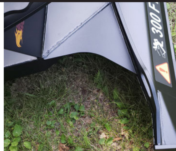
Discharge Deflector Plate